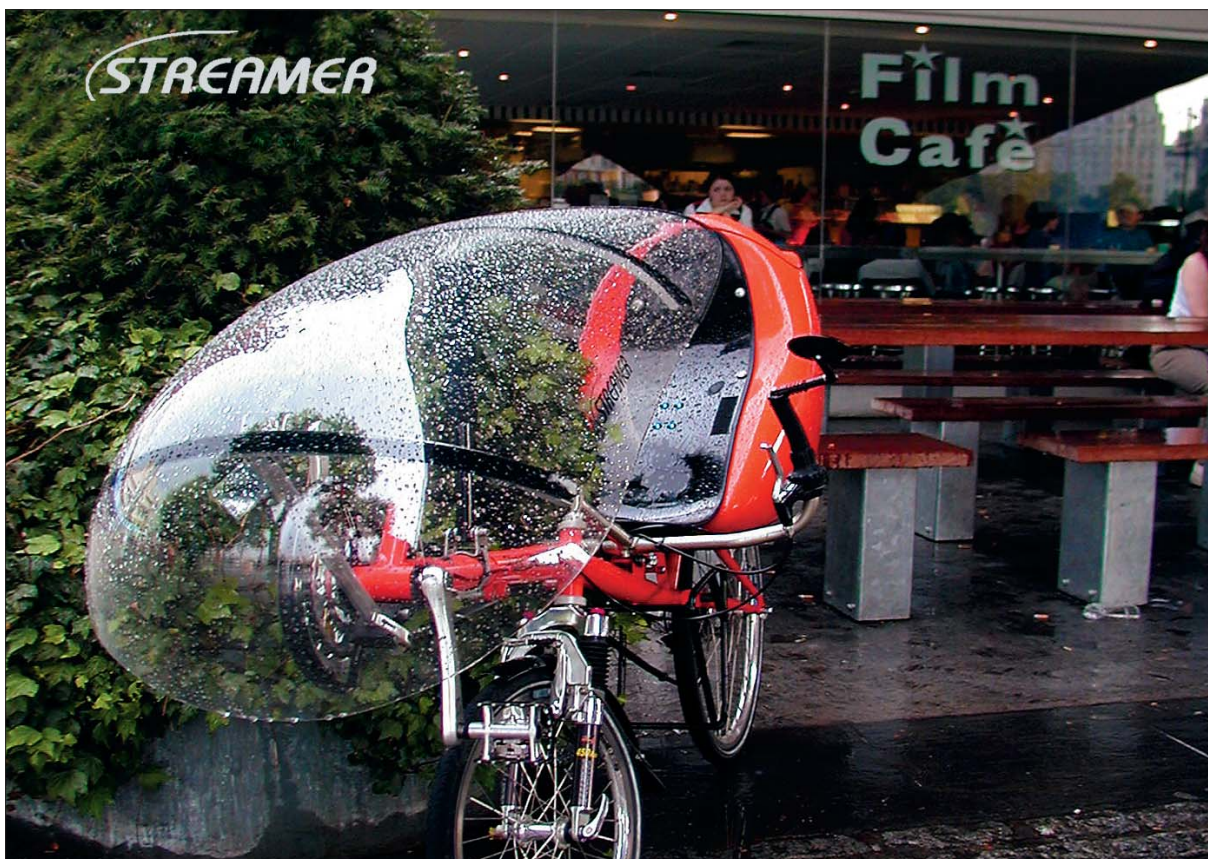
Comfortably sheltered on your way to the café: Street Machine Gt recumbent with Streamer front fairing and Speedbag rear fairsing.